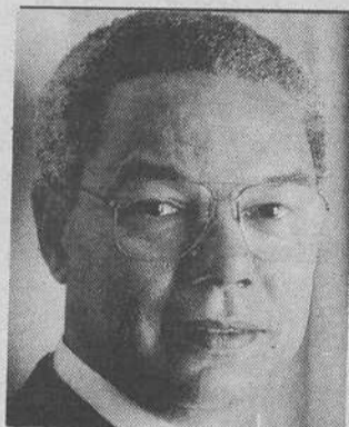
Due to commitments to promote his new book, Colin Powell will not attend Million Man March.

WASHINGTON - Retired Army Gen. Colin Powell turned