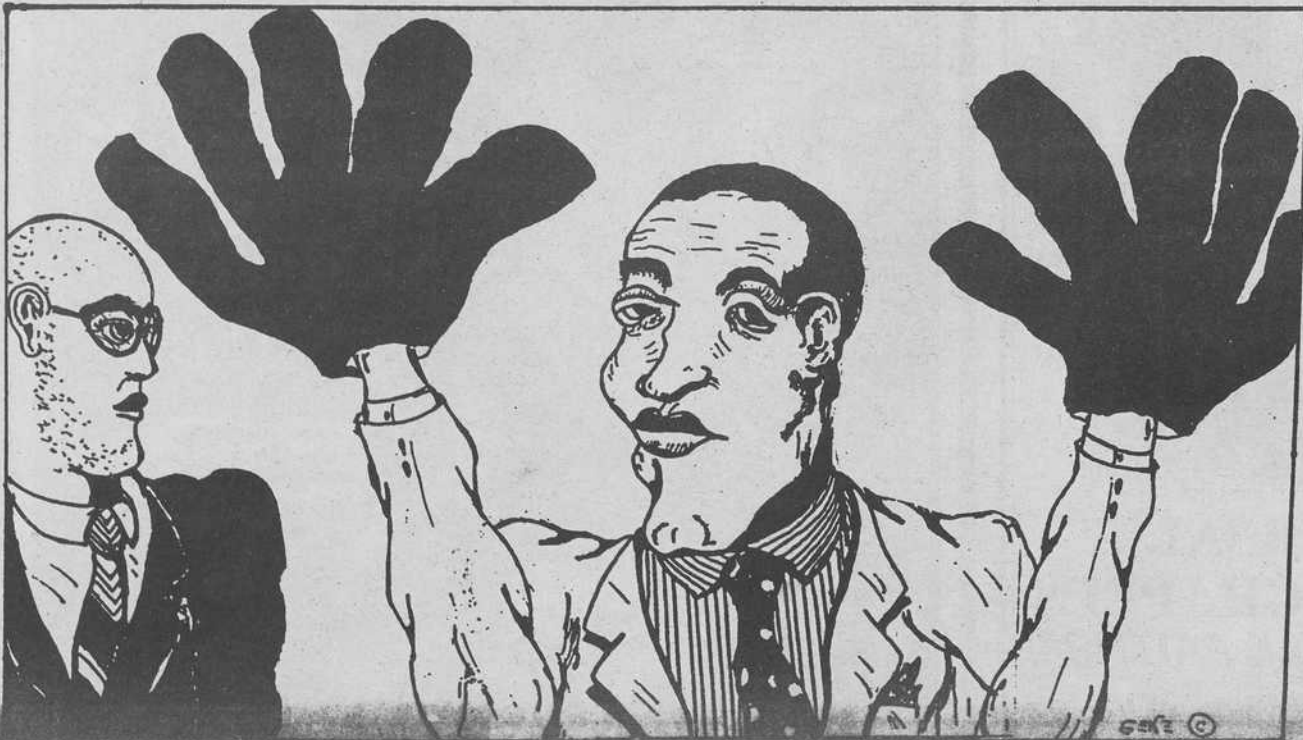
I DON'T BELIVE THEY FIT!!!!!!