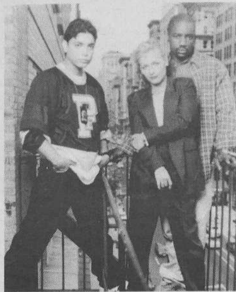
The cast of "New York Undercover"

Rounding out FOX Thursday night is New York Undercover is a one-hour drama about a squad of young New York City police detectives struggling to clean the streets of criminals while attempting to make sense of their own lives. Set to a contemporary musical beat and filmed in a driving visual style, the series offers a close-up look at the lives of many of America's urban youth, (See FOX Lineup, Page 21)