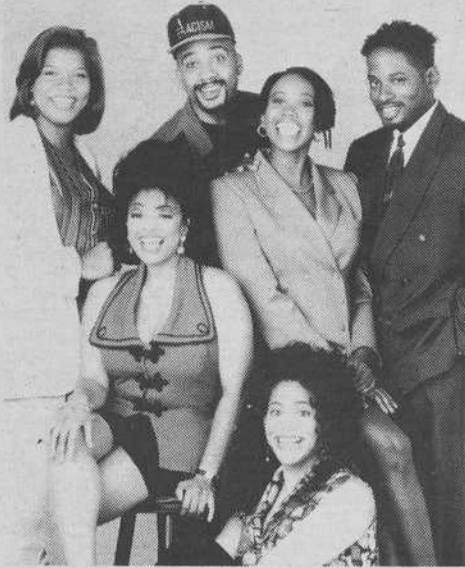
The cast of "Living Single"

Living Single , the fresh half-hour comedy starring Queen Latifah, Kim Coles, Kim Fields-Freeman, Erika Alexander, John Henton and T.C. Carson, enters its third season this year and opens FOX Thursday night line-up. The series follows six upwardly mobile African American friends living in New York City and trying to make sense of their lives, their loves and their careers.