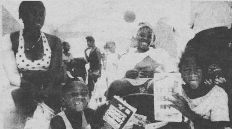
Doolittle Community Center, were also bussed in to take part in the special event. Lunch was provided for all in attendance.

Frontier Girl Scout Council hosted a Back-to-School Carnival on Friday, August 18 at the Herbert Gerson housing development in West Las Vegas. Approximately 225 boys and girls of every school age were on hand to take part in various games of skill in a carnival setting and win needed back-to-school supplies such as pens, pencils, crayons, notebooks, binders, rulers, scissors, dictionaries, etc. Clowns were also present to entertain, face paint and tie-off balloons in favorite animal shapes. Children from the Meadows Village area behind the Stratosphere Tower, as well as the