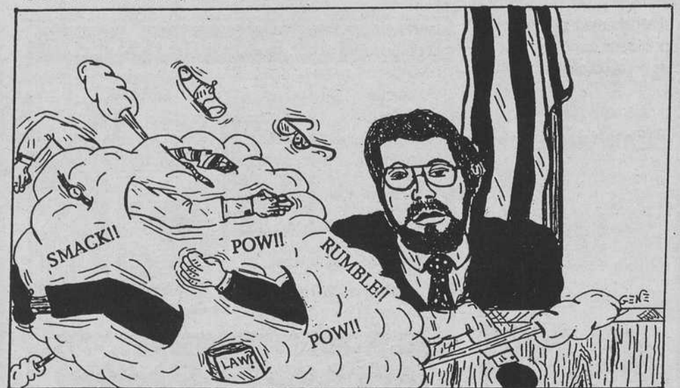
AND NOW !! LET'S GET READY TO RUMBLE!!!!