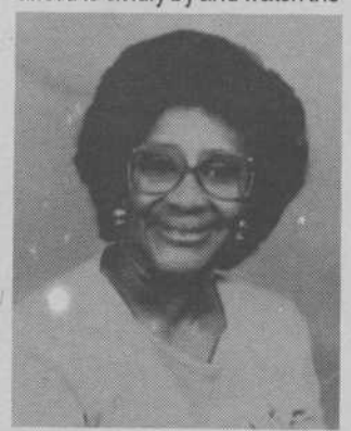
REV. WILLIE BARROW

unemployment is at an all time launching the "gangsta' rap" Convention was to consider the high. At the same time, our precarious economic status is being seriously eroded. We can't afford to sit idly by and watch the