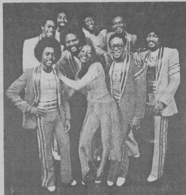
Don't miss recording artists Rose Royce, known for their 1970's hits "Car Wash," "I'm Going Down," "Ooh Boy," and "Love Don't Live Here Anymore," as they bring their show to THE HOP, 1650 East Tropicana (between Maryland Parkway & Spencer), on Thursday, July 6, at 9 p.m. For ticket information call the 24 hour hotline (702) 399-7285, or for ticket delivery call (702) 389-6088.

$ EMERGENCY CASH ADVANCE $ $100.00 TO $300.00 IMMEDIATELY