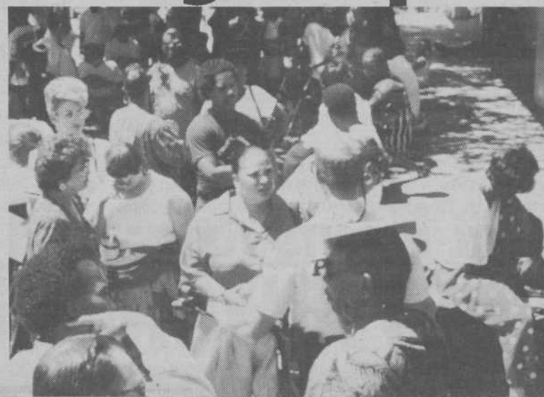
More than 500 potential applicants turned out for Metro's and the Housing Authority's Job Fair in Gerson Park.