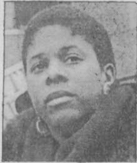
DR. LENORA FULANI