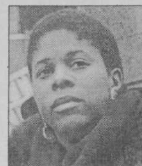
DR. LENORA FULANI

When the Republicans grabbed their victory they set the stage for a major political restructuring. The Black community can go down with the sinking Democratic Party or we can move aggressively into