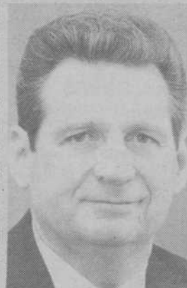
GOVERNOR BOB MILLER

ducked the national Republican wave which had cost Democrats several governorships and Congressional seats.