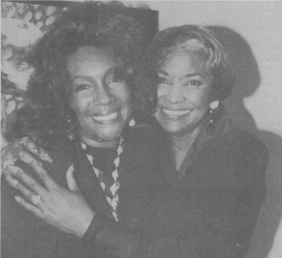
Spread Love the Wilson Way - Two musical legends, (L) Mary Wilson (former Supreme) and Columbia's song stylist, Nancy Wilson (R) share a hug at "La Grande Affaire", the Sony sponsored gala held during the recent Congressional Black Caucus Annual Legislative Weekend in Washington, D.C.

After escaping slavery, Frederick Douglass was - for almost 50 years - the most outspoken and independent-thinking advocate for equality for African Americans in the 19th century. At a time when four million blacks were enslaved, Douglass depended on the power of his words, both spoken and written, to engage and change the thinking on the issues of slavery and full citizenship for black people in America. Douglass' story is important and relevant because, as historian David Blight says in (See Frederick Douglass, Pg 27)