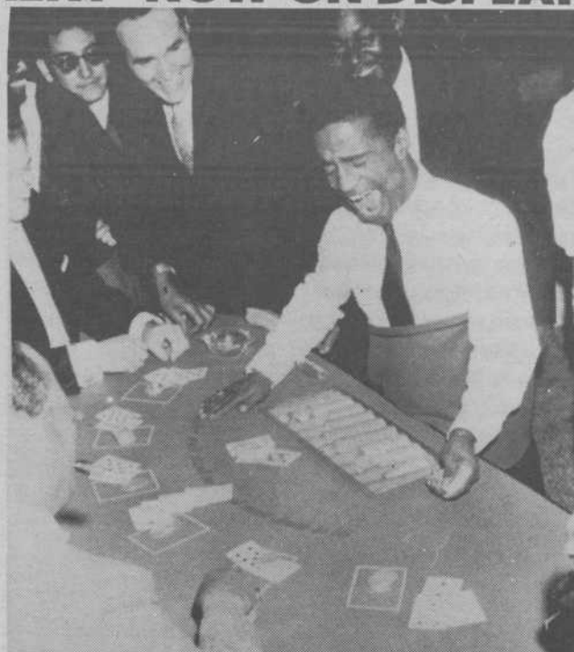
Sammy Davis Jr. at the New Town Tavern (1962)