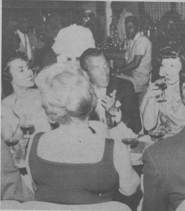
Ed Sullivan at the New Town Tavern (1962)