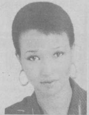
MAE C. JEMISON