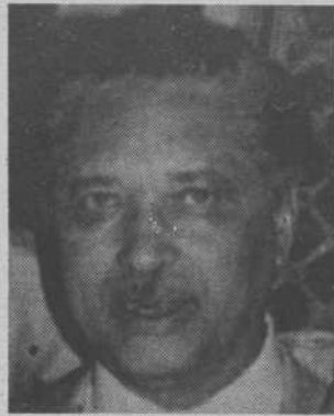
REV. LEON H. SULLIVAN

The United Negro College Fund will host the symposium "Historically Black Colleges and