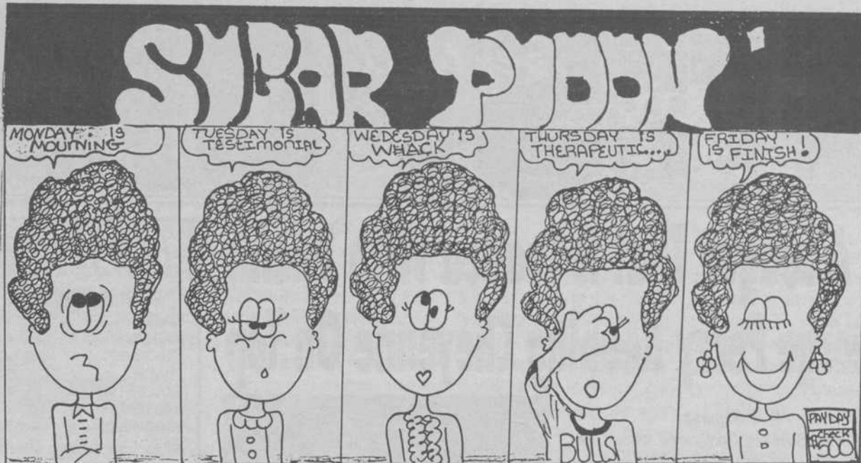
BY ZELDA FURYEAR