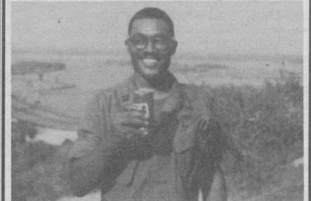
Quang Tri, Viet Nam, 1969