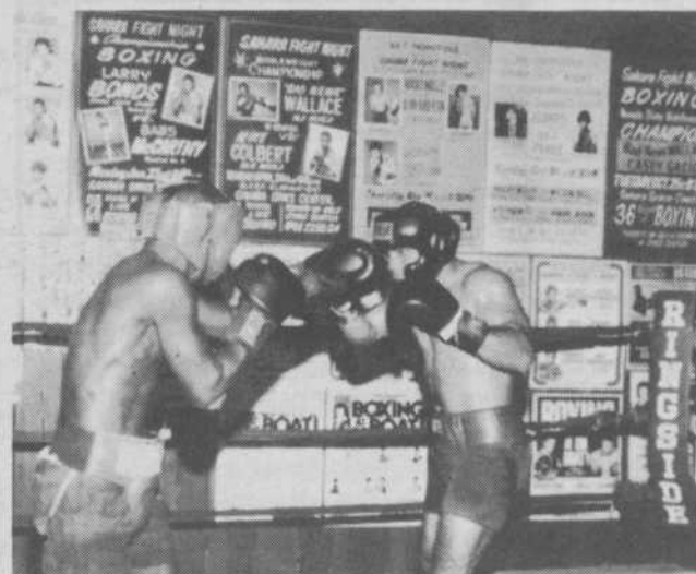
While young aspiring boxers spar inside the ring at Ringside Gym, history surrounds them in the form of posters which are plastered on the walls of the landmark.