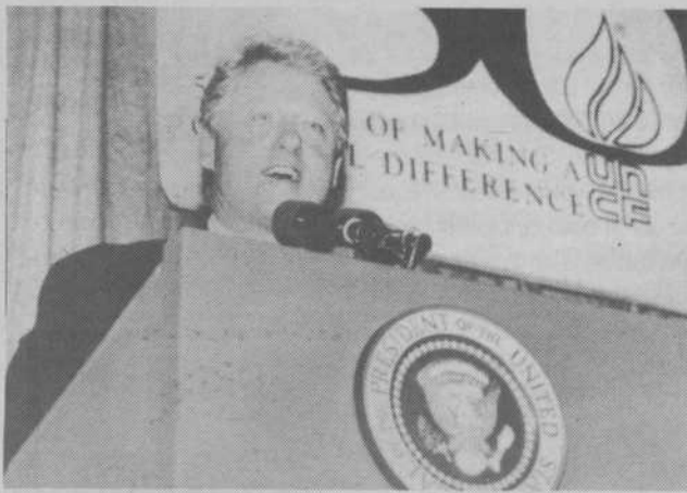
President William J. Clinton delivers the keynote speech to UNCF President, William H. Gray, III, an audience of leaders from the political and business communities, college presidents and students at the United Negro College Fund's 50th Anniversary Dinner in New York.

In a historic speech, President Clinton pledged his support for equal educational opportunity at the United Negro College Fund 50th Anniversary Dinner in New York City. The President spoke of learning as "the key to liberation."