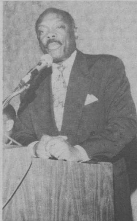
Keynote speaker, Willie Brown, California Speaker of the Assembly