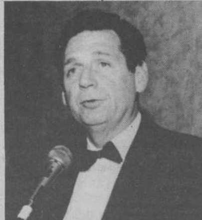
Nevada Governor Bob Miller