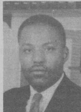
Assemblyman Wendell P. Williams

BLUE LIGHT SPECIAL #3 Count on Las Vegas Sentinel-Voice to live up to its slogan "The Truth Shall Set You Free." In the September 30, 1993 edition of the Sentinel-Voice in this very column entitled "Thinking