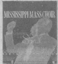
MISSISSIPPI MASS CHOIR

The above list is based on in-store sales as reported by LUCKY RECORDS 3416 E. Lake Mead Blvd., • North Las Vegas, Nevada. (702) 399-2299.