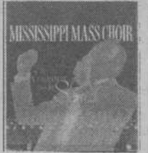
MISSISSIPPI MASS CHOIR

The above list is based on in-store sales as reported by LUCKY RECORDS 3416 E. Lake Mead Blvd., • North Las Vegas, Nevada. (702) 399-2299.