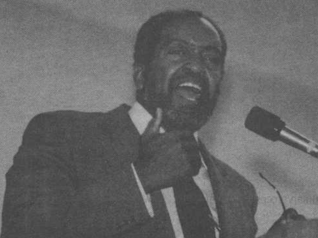
Imam W. Deen Mohammed, son of Honorable Elijah Muhammad and Muslim American spokesman for Human Salvation