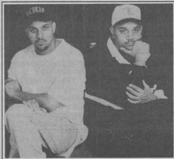
THE DIRECTORS ALBERT (L) AND ALLEN HUGHES

"People need to get together," he added. "I know it's our job to do something about it as well as everybody else's, but it's everybody's job to come to the table to understand how things started, the neglect, everything."