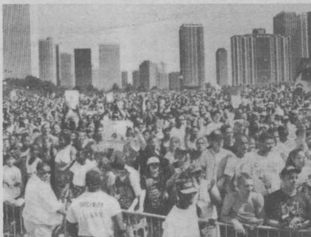
....a thousand words.

Bulls fans following Chicago's NBA championship season.