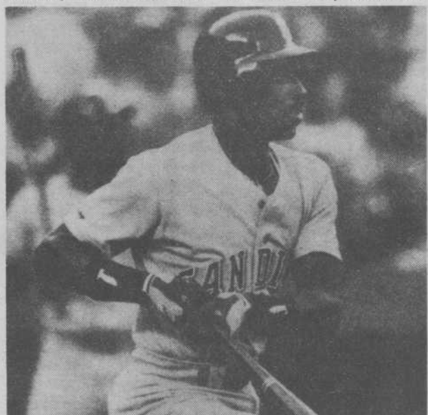
In hot pursuit by American League East contenders New York and Baltimore, is San Diego's first baseman Fred McGriff.

Clemens was expected back just before the All-Star break but he continued to experience soreness in his right groin which led to speculation he'd be out 'til late July. Andre Dawson and Mike Greenwell seem to be 100% as their hitting has picked up immensely. Dawson nailed three home runs in a seven-game stretch and Mike Greenwell hit at a .350 pace for three straight weeks.