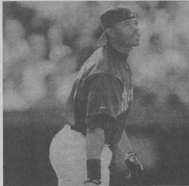
Centerfielder Ken Griffey, Jr., will be a vital part of the Mariners' drive toward the American League Western Division title.

The Chicago White Sox are in the middle of the league in Batting but hold their slim lead over the Royals in the West, and open the second-half in the Eastern Division basement, Milwaukee. Before the All-Star break, Bo Jackson replaced designated hitter George Bell in order to get more comfortable behind the plate. Jackson responded against Baltimore with a 426-foot home run. The White Sox will have to turn up the heat early on or be prepared to squander their lead away.