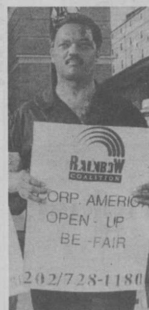
Rev. Jesse Jackson

"This is not designed to embarrass (the Baltimore Orioles)...It is clearly designed to embarrass Major League Baseball to do what apparently one would think they would do 46 years after Jackie Robinson broke the color barrier," said Mfume.