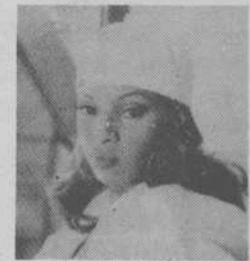
MARY J. BLIGE