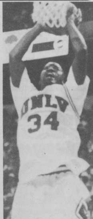
ISAIAH J.R. RIDER

UNLV's Isaiah J.R. Rider was nabbed fifth by the Minnesota Timberwolves, and has been fingered by many as the best player in the entire draft. Argua-