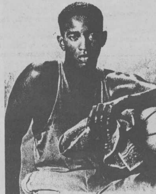
This is a message from the U.S. Centers for Disease Control.

Skin popping, on occasion, seems a lot safer than mainlining. Right? You ask yourself: What can happen? Well, a lot can happen. That's because there's a new game in town. It's called AIDS. So far there are no winners. If you share needles, you're at risk. All it takes is one exposure to the AIDS virus and you've just dabbled your life away.