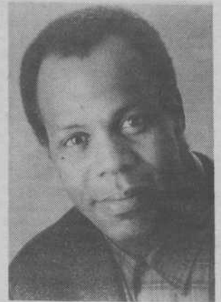
DANNY GLOVER Honorary Chairman 1993 Black Family Union

In addition to the many positive stories and editorials celebrating the African-American family in all it's forms and diversity each year, The Black Family Reunion has also spawned a highly-rated, annual syndicated television special airing between