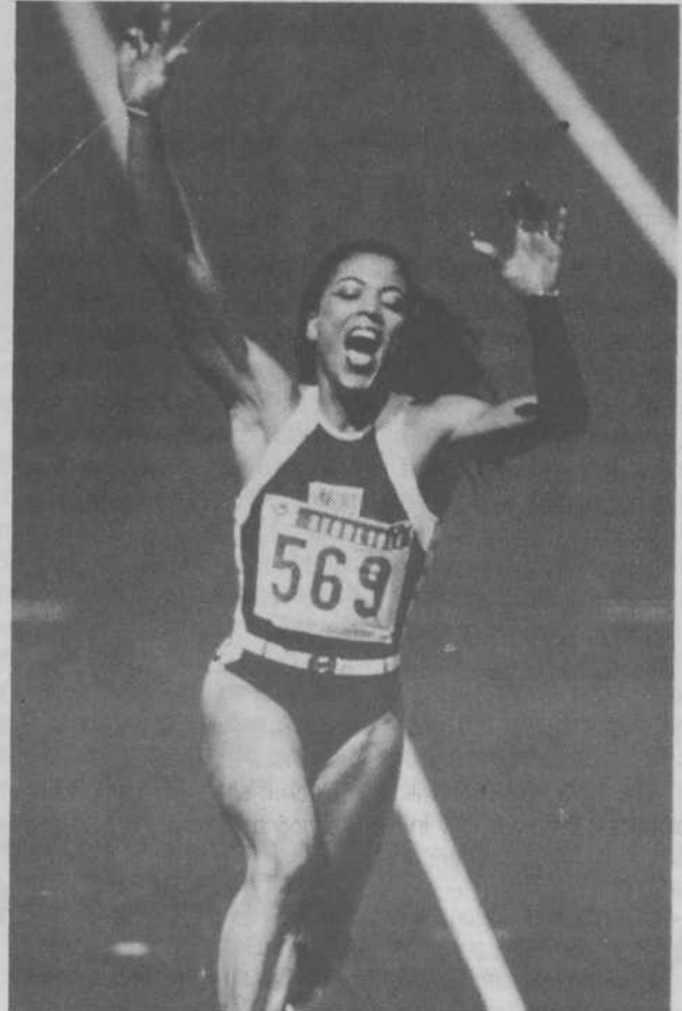
FLORENCE GRIFFITH-JOYNER Co-chief of the President's Council on Physical Fitness and Sports

"I thank you for lending your dignity to this occasion and for your service to this country and your embodiment of the best values of America," said Clinton.