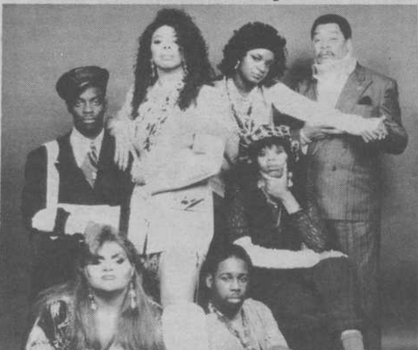
MILLIE JACKSON, THE CAST ALBUM