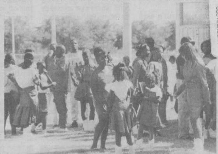
Drill Team performances highlighted Unity Block Party.

Las Vegas — Close to 2,000 area residents withstood the summer heat last Saturday, flooding the Doolittle Community Center for the first annual Unity Festival Block Party.