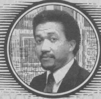
Dr. Benjamin F. Chavis 1993 -