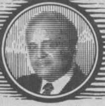
Dr. Benjamin L. Hooks 1977 - 1993