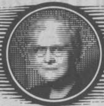
Mary White Ovington 1911 - 1918