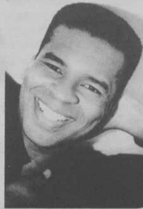
DAVID ALAN GRIER

It will be an evening of "In Living Comedy" as David Alan Grier and Jamie Foxx from the hit series "IN LIVING COLOR" perform for one evening only at the Aladdin's Theater For The Performing Arts Saturday, May 8, 1993 at 10:00 p.m.. Doors open at 9:00 p.m.