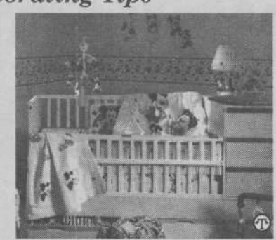
Coordinated accessories help make this nursery a delightful place in which to grow.

Accessories add the final touch. These can include a lamp, clock, light switch covers, announcement pillow, ceramic figurines, picture frames, stuffed animals, and bookends.