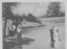
THE BAPTISM 17-1/2 x 24 $30