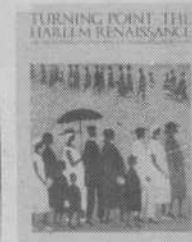
TURNING POINT/ FUNERAL PROCESSION 18 x 25 $25