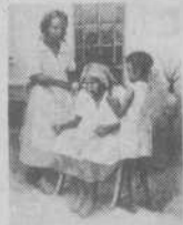
THREE GENERATIONS 20 x 24 $30