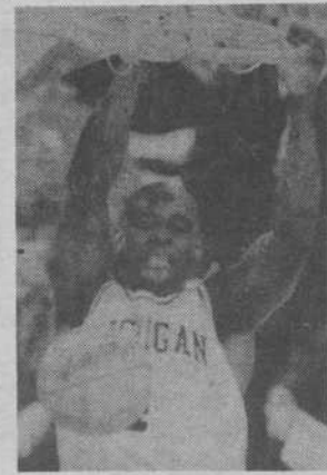
All-American Chris Webber