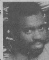
JOHN P. KEE

The above list is based on in-store sales as reported by LUCKY RECORDS , 3416 E. Lake Mead Blvd., • North Las Vegas, Nevada. (702) 399-2299.