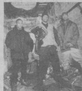
NAUGHTY BY NATURE