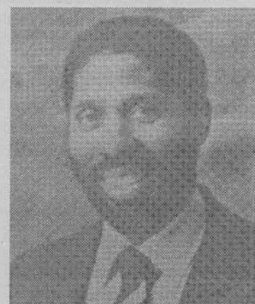
DR. JAWANZA KUNJUFU

The National Association of Black Journalists is the premier media organi-