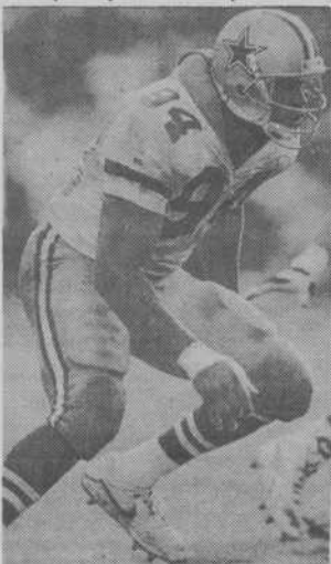
Dallas DE Charles Haley