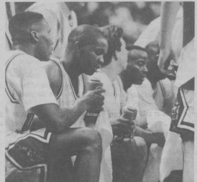
PULLING TOGETHER- The Rebels continuously pulled together Tuesday night to stage their comeback over Texas A&M. Trailing by as much as 15 points in the second half, UNLV used furious runs of 14-3 and 21-10 to erase A&M's lead.