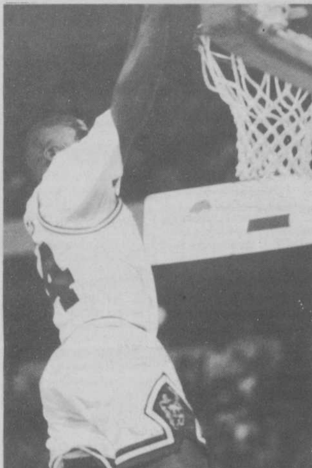
BIG WEST & ESPN PIZZA HUT PLAYER OF THE WEEK J.R. RIDER