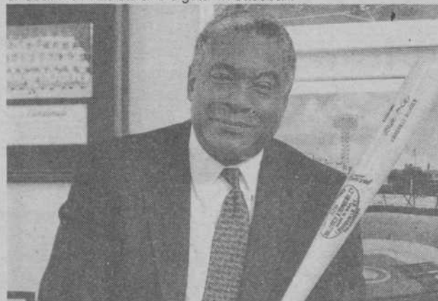
National League President Bill White

28- National League president Bill White, speaking at the Black Coaches Association convention, laments his inability to further minority hiring in baseball and says he is angry and bitter at having to deal with "racists and bigots" in baseball.