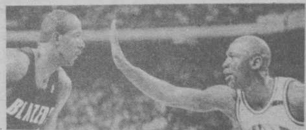
Clyde Drexler and Michael Jordan