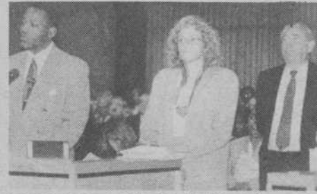
Complaints were filed against the Library District after two popular West Las Vegas Library employees were transferred. In November Assemblyman Wendell P. Williams characterized the Library District as government "out of control" because of it's unaccountability.