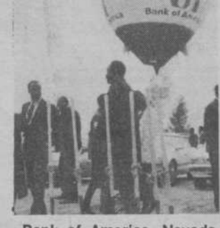
Bank of America, Nevada broke ground in West Las Vegas and will become the area's first major financial institution.