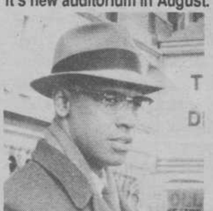
Though surrounded by controversy, Spike Lee's highly anticipated "Malcolm X" opened to moviegoers across the nation in December.