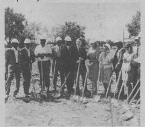
The West Las Vegas Library broke ground on it's new auditorium in August.