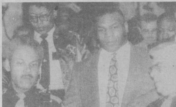
Mike Tyson was found guilty on all charges in the rape case of a Miss Black America Pageant contestant in Indianapolis.