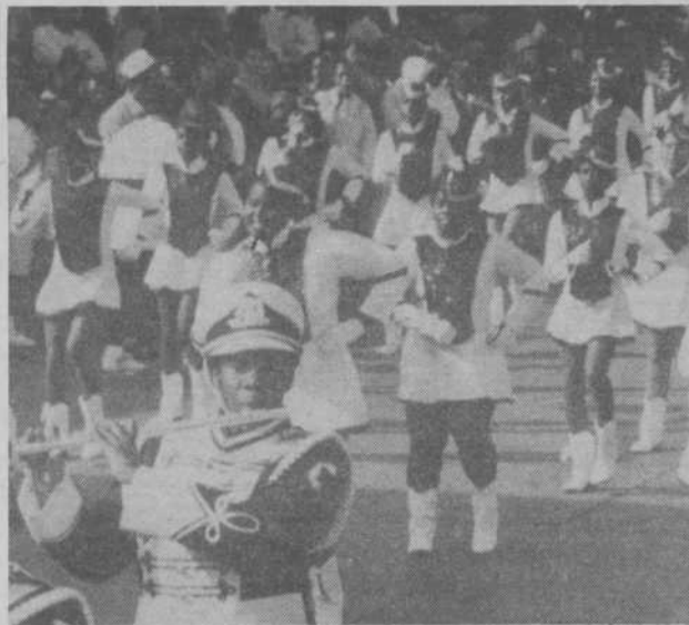
With over 150 floats and thousands of spectators along the two mile parade route, the Martin Luther King Jr. Committee hosted its largest parade ever.