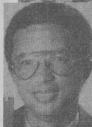
Tennis great Arthur Ashe emotionally announced he has AIDS.