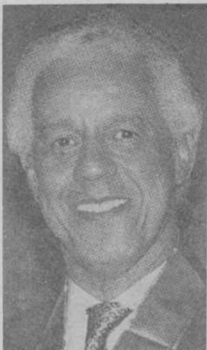
To start the year off, Virginia Governor Douglas Wilder withdrew from the Democratic presidential race on Wednesday, January 8.