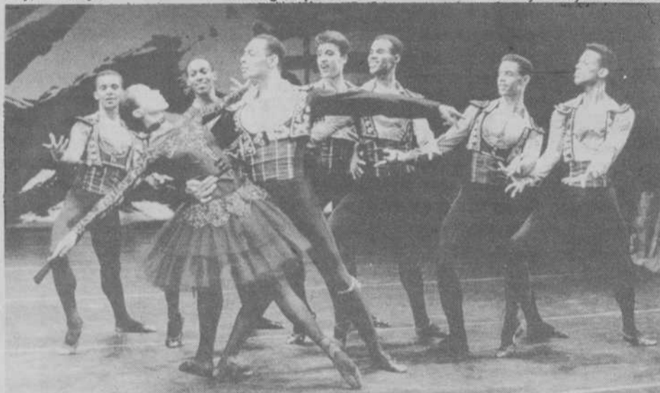
The Dance Theatre of Harlem, which in only 24 years has become one of the worlds outstanding classical ballet companies, traveled to UNLV's Artemus Ham Hall for two performances, February 3rd and 4th.