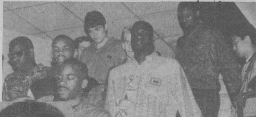
Jerry Tarkanian received a well deserved farewell ceremony after his retirement, however, a week later, Rebel players discovered there would be no "March Madness" as they were blocked in District Court from competing for the National Championship.