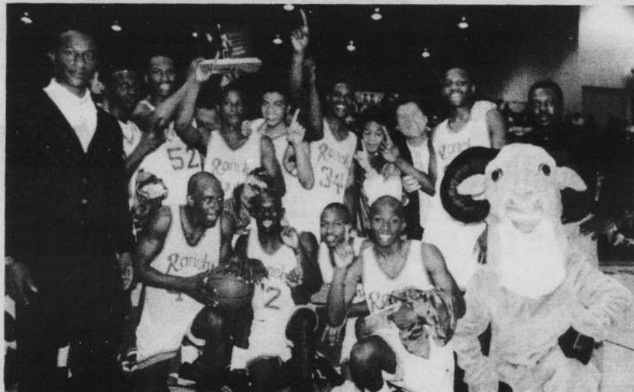
(This is the fourth of a five-part series that looks back at the sports world in 1992)