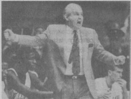
Rollie Massimino takes over the helm at UNLV this season with the Runnin' Rebels.

The other two contenders in the conference this year look to be UC Santa Barbara and Long Beach St.