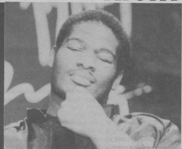
Champion Evander Holyfield sits quiet with a look of disgust while challenger Riddick Bowe ponders.