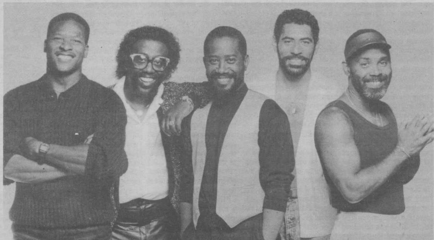
MAZE — Featuring Frankie Beverly returns to Las Vegas Saturday, November 14th